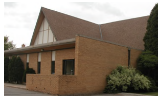
Prince of Peace Building Renewal

Dedication service for the renovation of the sanctuary and narthex will be Sunday, January 25, 2009 at both services.