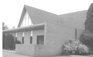
Prince of Peace Building Renewal

The renovations are taking shape. Sanctuary carpet and windows are installed. Walls have been prepped, primed and painted. The "spirit" wall is mostly installed. Project workers and volunteers are working hard to prepare the sanctuary for Christmas Eve worship. Be sure to invite family and friends to check out the new look of Prince of Peace. Thank you for your patience and support during the renovations.